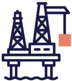
OIL, GAS AND MARINE