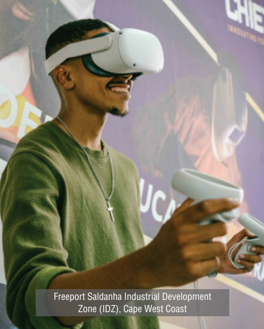
Freeport Saldanha Industrial Development Zone (IDZ), Cape West Coast