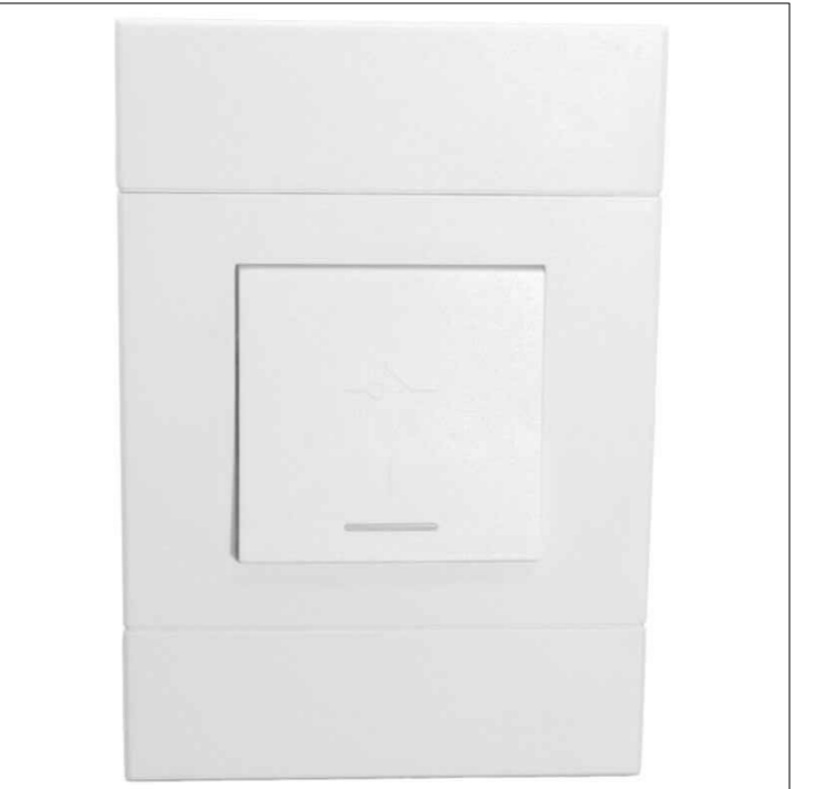
05 VETI 2 - 1x ISOLATOR SWITCH