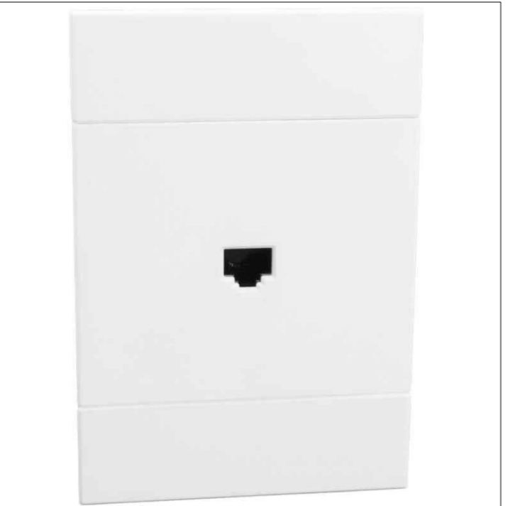
06 VETI 2 - 1x DATA POINT