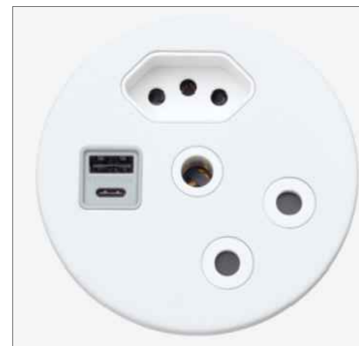
08 D4 - DOT EVO WHITE