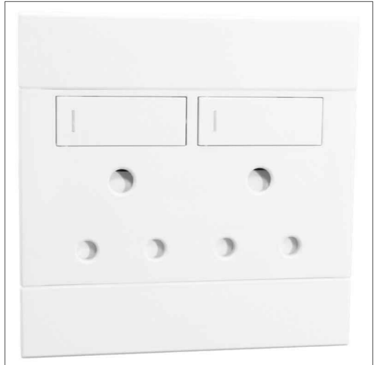
03 VETI 2 - 2x OLD RSA WITH SWITCH