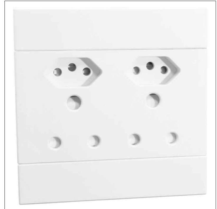
02 VETI 2 - 2x OLD RSA & 2x NEW RSA