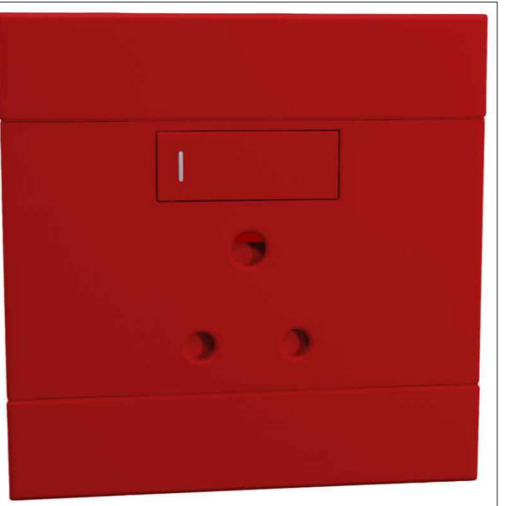
07 VETI 2 - 1x DEDICATED OLD RSA WITH SWITCH