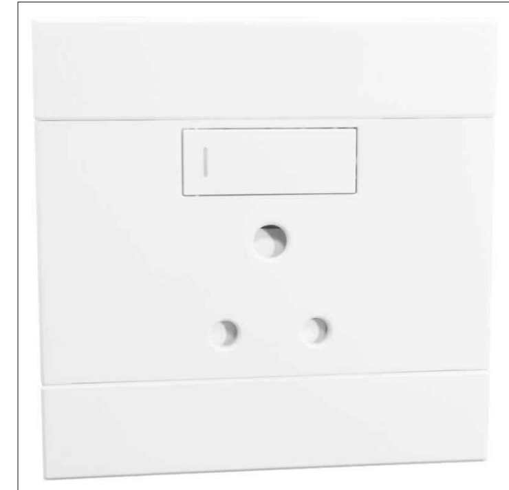
01 VETI 2 - 1x OLD RSA WITH SWITCH