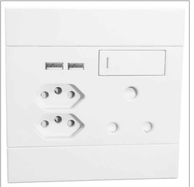
04 VETI 2 - 2x USB, 2x NEW RSA, 1 OLD RSA