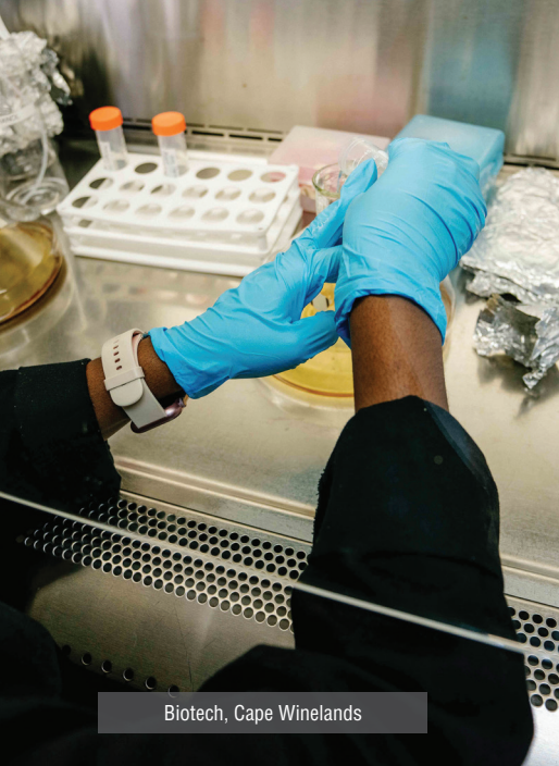
Biotech, Cape Winelands