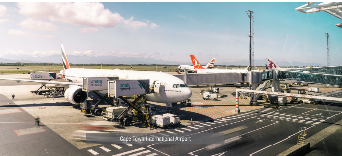
Cape Town International Airport