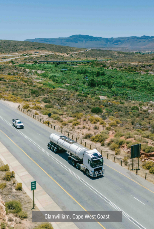
Clanwilliam, Cape West Coast